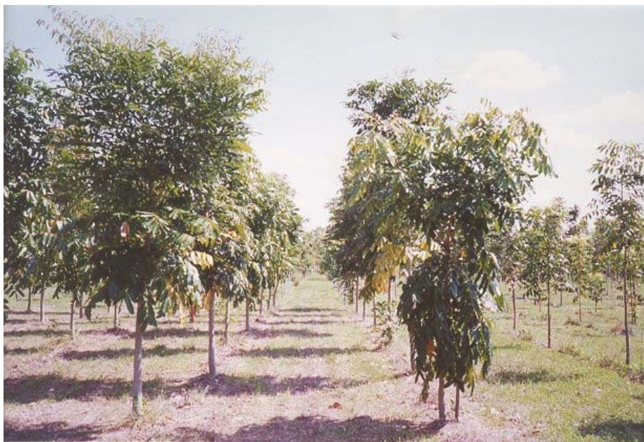
Figure 1. Young African mahogany, age 22 months, grown at Katherine

During the first year of growth, the seedling develops a strong, deep taproot, (see Figure 2) which makes it the most drought hardy of all the Khaya species. Its deep taproot provides the tree with the ability to access moisture deep in the soil profile and stability in high winds. When planted in shallow rocky soil types, taproot development maybe severely restricted, reducing resistance to wind damage and tree vigour. African mahogany was planted for the first time around Darwin in the Northern Territory (NT) in the late 1950s and showed potential as a plantation species in the Top End. In a series of Commonwealth-funded trials in the Top End of the NT, K. senegalensis was the outstanding species for growth compared with other high-value tropical hardwoods (see Figure 1).