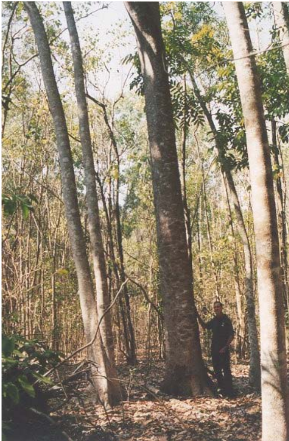
Figure 3. A good tree suitable for seed collection, with a straight trunk of 11 m to the first branch