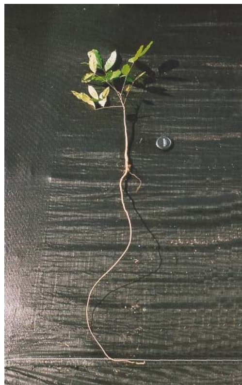
Figure 2. Seedling with a strong and deep taproot

Seed for growing trees in plantations should be selected from good individuals with long straight trunks (Figure 3). However, superior seed is not readily available and, for this reason, clonal seed orchards (based on superior trees) have been established in Darwin and in north Queensland (see Figure 4). These orchards have already started producing good genetically-improved second generation seed for further deployment and evaluation.