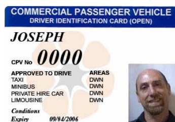
OPEN CARD DARK BLUE BAND