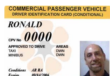
CONDITIONAL CARD YELLOW BAND