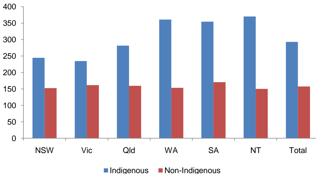
Figure 2: Overnight separations per 1000 population, 2009-10