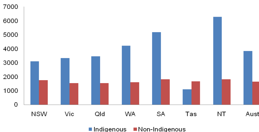
Chart 3: Per capita expenditure by Indigenous status, 2006-07