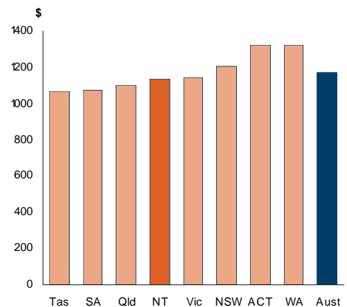
Chart 2: Average Weekly Earnings (seasonally adjusted)