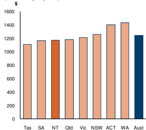
Chart 2: Average Weekly Full-Time Earnings (Seasonally adjusted)