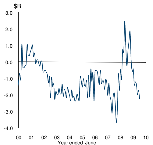
Chart 2: Balance of Trade, Australia (Monthly, seasonally adjusted)