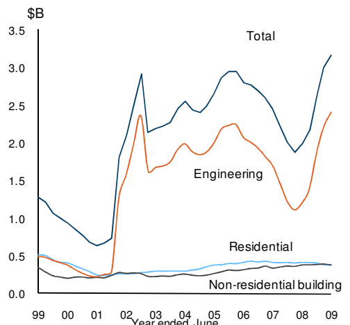
Chart 1: Territory Construction (moving annual total, chain volume)