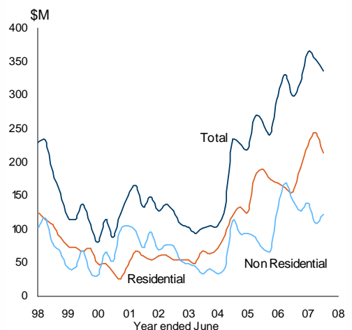
Chart 3: Territory Work Yet to Be Done (chain volume)