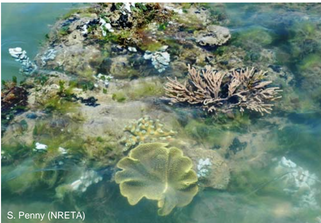
S. Penny (NRETA)

The distinctive colours of corals come from millions of microscopic algae (zooxanthellae) which live symbiotically in the tissues of the coral polyps. Due to the dependence of zooxanthellae on sunlight, corals generally only occur in shallow, clear water. Corals vary from solitary corals (consisting of a single large coral polyp) and soft corals (without a hard skeleton), to hard, reef-building scleractinian corals.