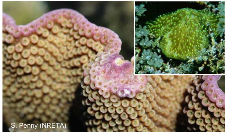
S. Penny (NRETA)

Individual coral polyps can be clearly seen in this Turbinaria sp. found off Casuarina Beach. Inset: A solitary mushroom coral ( Fungia sp.). Photo courtesy of the Great Barrier Reef Marine Park Authority.