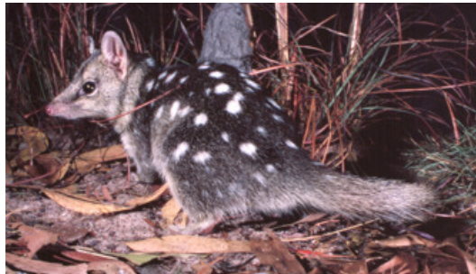
Northern Quoll

The northern quoll is a distinctive carnivorous marsupial. It is the size of a small cat (weight 300-1100 g), with prominent white spots on a generally dark body, with a long sparsely furred tail.