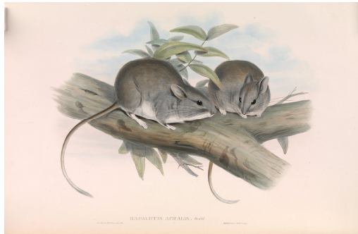
lesser stick-nest rat (J Gould)

The lesser stick-nest rat was a moderately sized native rodent (body mass 60 g) that differed from its larger relative, the greater stick-nest rat, by the narrow brush of white hairs near the tip of its tail.