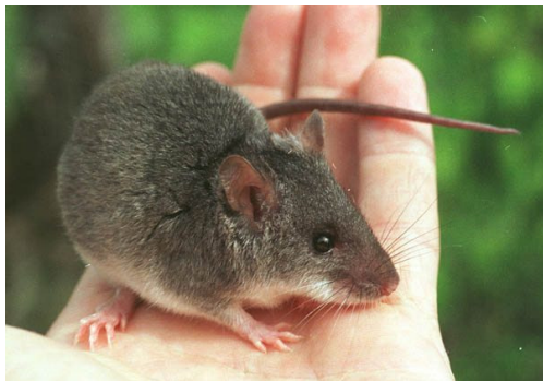
false water-rat.

The false water-rat is a small (35-50 g) rodent of unmistakable appearance. The most distinctive external features are a broad relatively short face, and very short sleek fur. Fur colour is pale grey above and white below. The eyes and ears are relatively small.