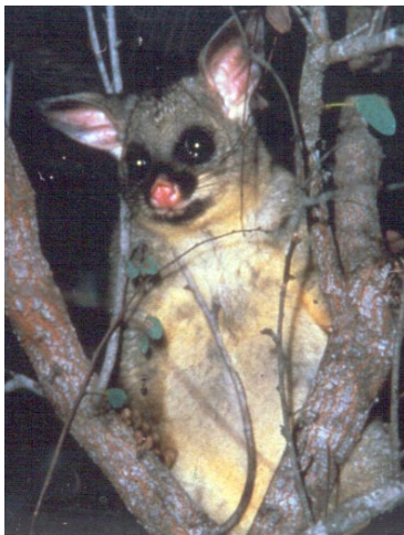
Common brushtail possum.

The common brushtail possum is a medium-sized mammal (body mass of 1.3-3 kg) about the size of a domestic cat. It has large, prominent ears that have a narrowly round tip and are longer than they are broad. The bushy tail is slightly shorter than the head-body length.