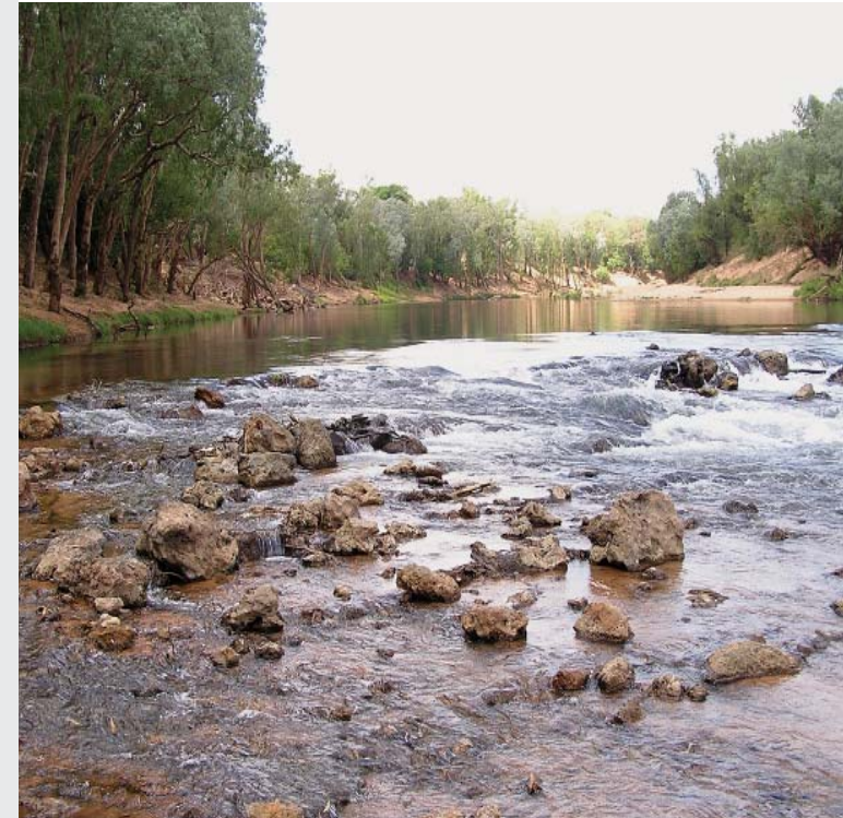
Ooloo Crossing, Daly River

Department of Natural Resources, Environment, The Arts and Sport Randazzo Centre, 16 Katherine Terrace, Katherine PMB 123, Katherine NT 0852 Ph: 8973 8115 Email: water.nretas@nt.gov.au