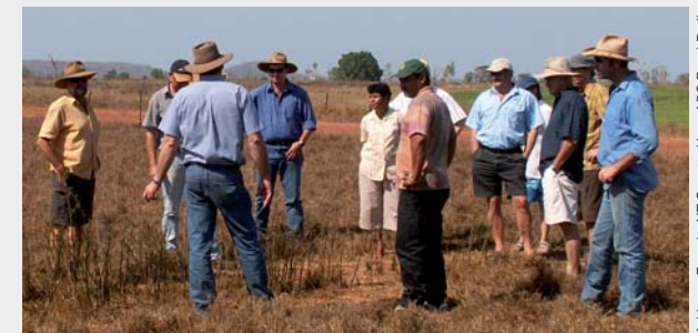
DRMAC members in the field

The members of DRMAC have the necessary knowledge, skills and experience of the Daly to perform this critical task. Government participation is designed to ensure that they have immediate access to the information and tools they need to do their job.