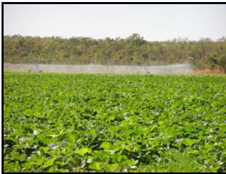
Pivot Irrigation- Commercial Operation, Katherine

These licences can be temporary for a few months or permanent with a renewal every 10 years. If the owner of the land or the licence changes, then a licence is reissued in the new owner’s name.