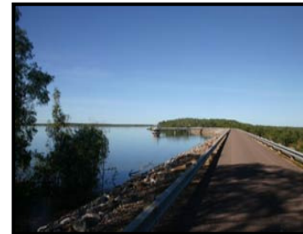
Darwin River Dam- Darwin Drinking Water Supply

Surface water resources in Central Australia are limited and are difficult to use commercially. However, surface water is used to supplement pastoral water supplies (eg. small waterholes). The more arid the region, the more likely a community will obtain its water from underground sources. The water supply for Alice Springs for instance, is all from bores (the Amadeus Basin).