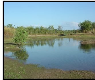
Abandoned Sand Mining Pits, Darwin- Man Made Wetlands

The majority of surface water in the Northern Territory is found in the top end. Darwin and Katherine extract their water supplies from surface waters. Katherine draws water from the Katherine River while most of Darwin's water is supplied from Darwin River Dam.