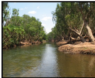
Katherine River – Perennial River

Ephemeral water bodies are those that only hold water for part of the year. Surface water can also be held in man-made structures such as river dams or rain-catching dams.