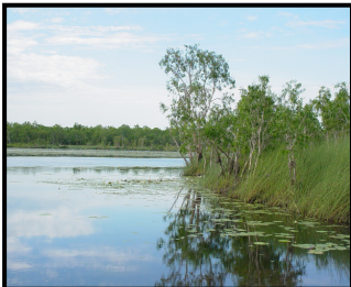
Girraween Lagoon – Perennial

There are three types of surface water; permanent (perennial), semi-permanent (ephemeral) and man-made. Permanent surface waters are present throughout the year. They are usually in the form of waterholes, lagoons, springs and swamps. At times when there is little or no rain, the water level is maintained by the groundwater table.