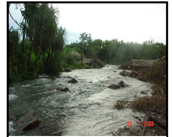
Rapid Creek - Weir used to direct flow of water