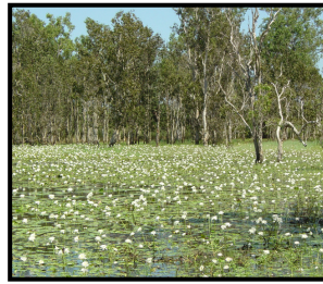
Ewart Lagoon- Ephemeral