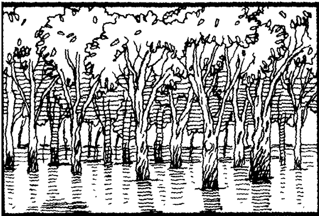
Some wetlands are dependent on groundwater for their survival.

If you own and pump water from a bore you are contributing to local groundwater level decline. Since aquifers can be quite extensive and the water within them is connected the usage of your bore may influence other people's some distance away. Groundwater also feeds creeks, rivers and springs during the dry season and excessive pumping from your bore during this time can also contribute to less water being available to these surrounding water dependant environments.