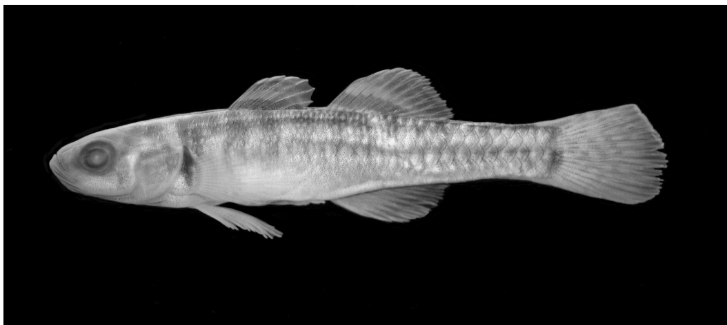
Fig. 1. Hypseleotris barrawayi sp. nov., holotype, 32.5 mm SL male, Gimbat Creek, Katherine River system, NTM S.15616-002.

Body slender and compressed, more so posteriorly; body depth at anal origin 13.9–22.9% of SL (Table 6); body depth at pelvic fin origin 16.3–21.8% of SL. Caudal peduncle long, length 21.8–31.0% of SL. Caudal peduncle depth 10.3–12.7% of SL. Head somewhat compressed, forming rough triangle (apex dorsally) in cross-section, usually deeper than wide at posterior preopercular margin, head length 23.6–29.3% of SL, depth at posterior preopercular margin 52.5–78.8% of HL, width at posterior preopercular margin 47.0–73.0% of HL. Large (captive adult) males with somewhat convex nape but none with 'hump'. Mouth short and oblique, forming an angle of about 30° with body axis; jaws ending anterior to eye, below posterior nostril. Upper jaw length 25.8–34.3% of HL; lips narrow; lower lip fused to chin anteriorly, side of lip free; no mental frenum present. Anterior naris at end of very short tube just above upper lip; posterior naris oval, close to anterodorsal margin of eye. Eye width 24.1–31.8% of HL. Interorbital broad, its width approximately equal to eye width, 24.7–33.6% of HL. Snout short, rounded to almost square in dorsal view, gently rounded to slightly pointed in side view, its length about equal to eye width, 21.2–28.6% of HL. Gill opening moderate, extending forward to under posterior margin of preopercle or slightly further forward (but not reaching eye). Gill rakers slender