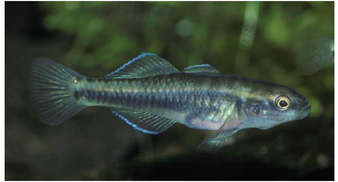
Fig. 3. Hypseleotris barrawayi sp. nov., captive male specimen.

Hypseleotris barrawayi is a slender species, similar in appearance to H. kimberleyensis . Both have 26 vertebrae, but differ in that H. barrawayi may have scales scattered on the predorsal region while H. kimberleyensis has none;