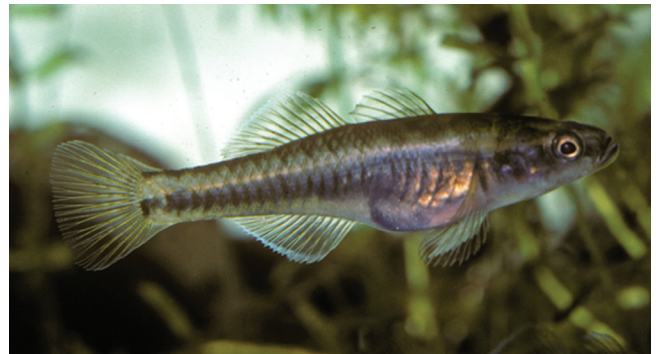
Fig. 4. Hypseleotris barrawayi sp. nov., captive female specimen.

H. barrawayi has a row of short dusky grey vertical bars along the mid-side of body while H. kimberleyensis has a series of X-shaped dark marks; H. barrawayi has the first and second dorsal fin with two broad dusky bands, one basal and one submarginal band, while H. kimberleyensis has a plain dark first dorsal fin and an almost plain second dorsal fin, with narrow whitish stripe along near-centre of the fin; H. barrawayi has the caudal fin usually plain or with few diffuse dusky bars or rows of spots, while H. kimberleyensis has a plain caudal fin, occasionally with two narrow wavy lines near the base.