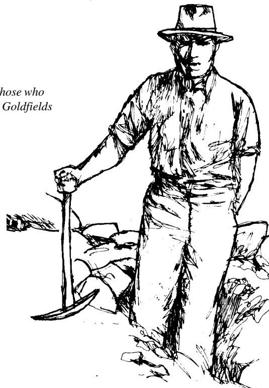
A miner - typical of those who worked the Arltunga Goldfields