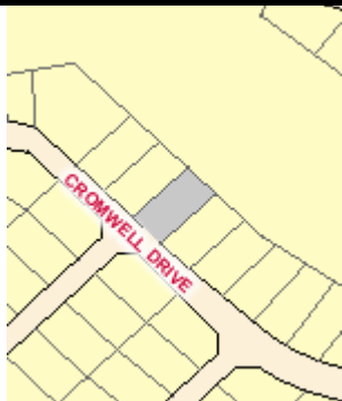
Lot 8309, Town of Alice Springs 130 Cromwell Drive, Desert Springs Single Dwelling-setback variations Project Building Certifiers Pty Ltd