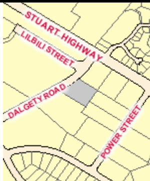
Lot 5827, Town of Alice Springs Dalgety Road, Braiiting Additional warehouse & verandah Probuild NT Pty Ltd