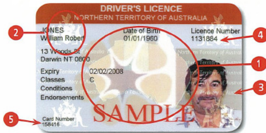
Actual size shown