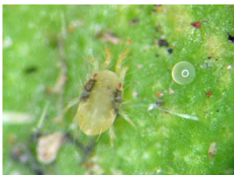
Two spotted mite adult and egg

Mites that are plant pests include spider mites (family Tetranychidae), false spider mites (family Tenuipalpidae), tarsonemid mites (family Tarsonemidae) and the rust or gall mites (family Eriophyidae). These mites cause damage by piercing plant cells and sucking out their contents. In heavy infestations mites may even kill the host plant.