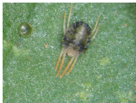
Oriental red mite adult and egg

Spider mites are given their name as they often spin characteristic protective silk webs. This family has more than 1000 species, which include some species of quarantine importance, and many species that may cause heavy losses to major food crops and ornamental plants. These include the infamous two-spotted mites Tetranychus urticae , and other major economic spider mite pests, which have been recorded in the Northern Territory e.g. oriental red mite, Eutetranychus orientalis - primarily a pest of citrus; vegetable spider mite, Tetranychus neocaledonicus ; and avocado brown mite, Oligonychus punicae . These species attack a wide range of horticultural crops. Mites may cause serious damage to plants but since they are microscopic they are usually not noticed until damage symptoms appear on the plant.