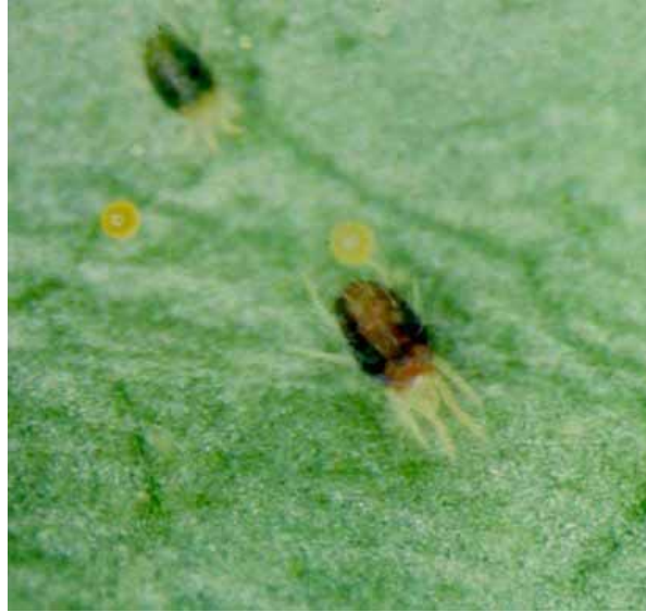
Figure 3. Two-spotted mites on a cucurbit leaf