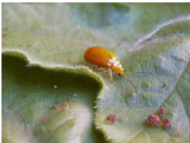
Figure 2. Plain pumpkin beetle adult on cucurbit leaf

There are two types of pumpkin beetles which can cause damage to cucurbit crops. They are of similar size (6–7 mm) and colour (yellow/orange). The pumpkin beetle ( A. hilaris ) is distinguished by four large black spots on the back. The plain pumpkin beetle ( A. abdominalis ) does not have these black spots. The adults lay their eggs into the soil amongst the roots of the plants where, once hatched, the creamy white larvae will feed until they pupate and emerge as adults.