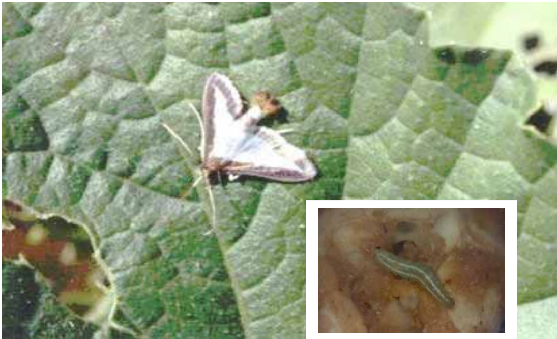
Figure1. Cucumber moth adult and larva