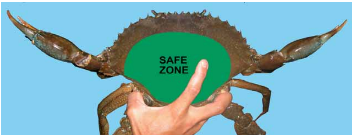
Figure 1. Recommended way to hold an untied mud crab

So you have caught yourself a mud crab – now what? The first challenge is to get it out of the pot. If the crab is reluctant to exit, you may need to tilt and shake the pot. Once the crab is free, it is important to get it under control as soon as possible because prolonged handling aggravates the crab and increases the chance of injury. Most crabbers use a length of metal or timber to restrain the animal. When attempting to pick up a mud crab, move in quickly from behind, place your index finger on the top of the shell (in the safe zone) and hold the last pair of legs (see Figure 1).