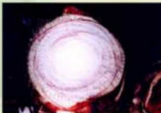
Healthy Plant A cross section of a healthy pseudostem