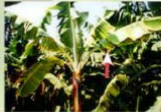
Early Stage Marginal leaf yellowing

Fusarium wilt, also known as Panama disease, is caused by the fungus Fusarium oxysporum f.sp. cubense which inhabits the soil. A strain of this disease known as 'tropical' race 4 (VCG 01213/16), which is known to be highly virulent on Cavendish, has been found in the Northern Territory. Fusarium wilt is a devastating disease with potential to destroy plantations. Clean planting material, early detection and containment are key strategies to prevent the spread of this disease.