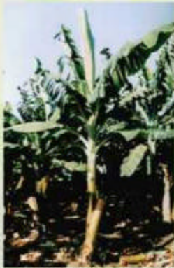
Healthy plant Healthy green leaves

Fusarium wilt, also known as Panama disease, is caused by the fungus Fusarium oxysporum f.sp. cubense which inhabits the soil. A strain of this disease known as 'tropical' race 4 (VCG 01213/16), which is known to be highly virulent on Cavendish, has been found in the Northern Territory. Fusarium wilt is a devastating disease with potential to destroy plantations. Clean planting material, early detection and containment are key strategies to prevent the spread of this disease.