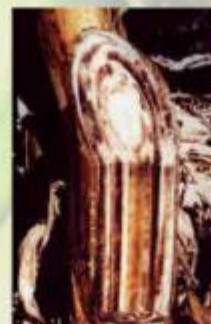
Mid to Late Stage Dark brown-black vascular tissue shown in cross section and in vertical section