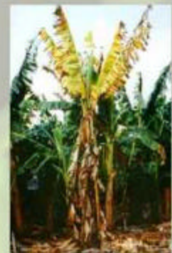
Late Stage Leaves later turn brown and may collapse at the petiole, leaving a "skirt" of dead leaves