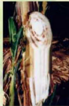
Early Stage A cross section of the pseudostem showing discoloration of the vascular tissue