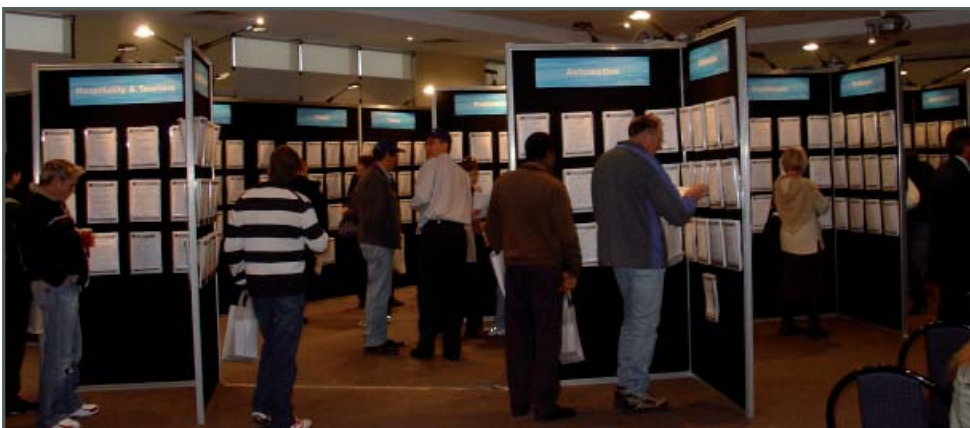
Potential employees in Newcastle keen to view jobs available in the Northern Territory.

An online database will be accessible to businesses wishing to find details of workers interested in relocating to the Northern Territory in the near future. More details on how to access this tool will be provided when available.