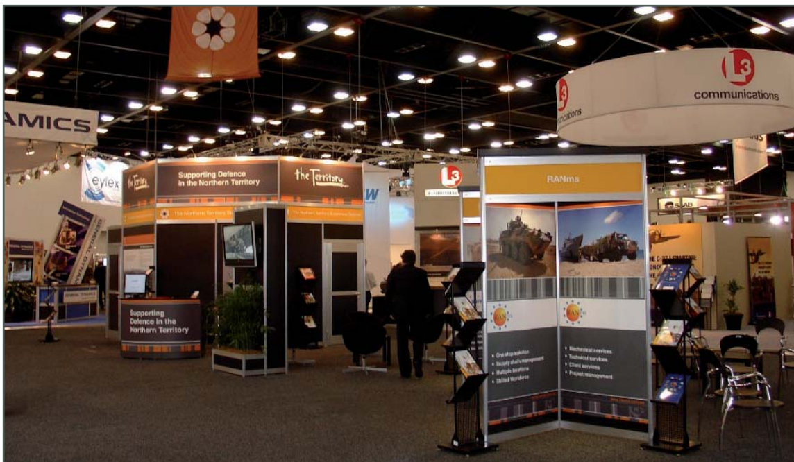
The Northern Territory stand at last year's Land Warfare Conference in Adelaide.