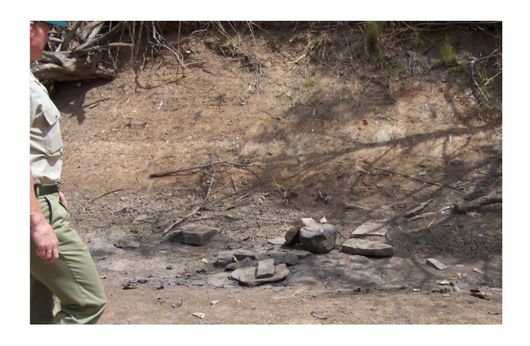
Rocks found in waterhole at the location of the body

59. Considering the discovery of large rocks in the young boy's shorts, and the time taken for the body to surface, it is in my view well within possibility that the rocks found under the body were used to weigh down the torso. I heard evidence that as the body decomposed it would bloat. Bloating could cause rocks placed on top of the torso to dislodge. Once dislodged, the upper body would become free to float. But the lower body remained weighed down by the rocks contained within the shorts. This reasoning would explain why the body did not float for two days, and why only the upper half was floating when it was discovered. It is also highly suggestive of foul play.