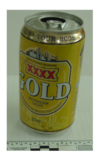
The XXXX can