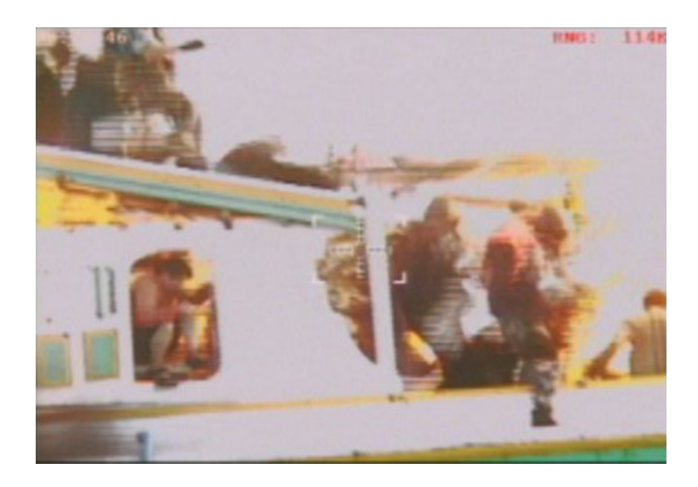
Childers EOD footage screen capture showing fire moving from bow to cabin

• I agree with Kelleher when he concluded that "Alternative explanations require complex combinations of unlikely incidents, and are improbable" <sup>101</sup>.