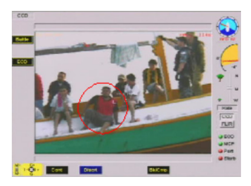
Childers EOD screen capture approximately 10 minutes before the explosion

A: Went and sat in the front of the boat. Approximately I sat for a minute from there and there and all of a sudden I heard the explosion. I was in the middle of the flame myself. That's what happened. That's all the story about myself."